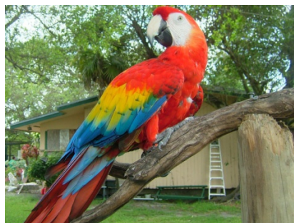
Macaws are one of the most beautiful animals at our barn