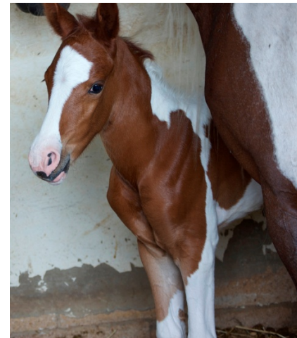
Roxy's filly, Bette Midler!