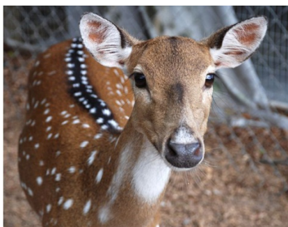
One of our many attractions is our beautiful White Tail Deer.