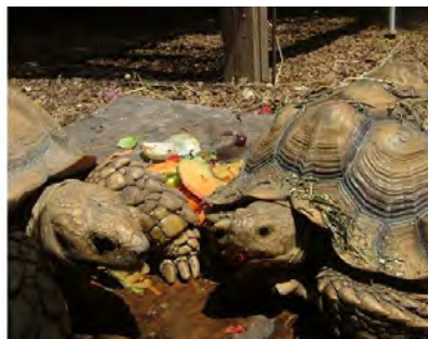
Lunch time at the Ranch