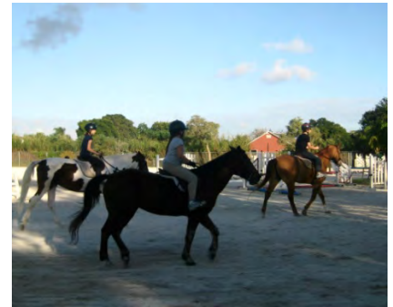
Some of our amazing riders