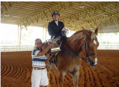
Icarus and Ashley