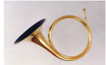
Hunting Horn Stables